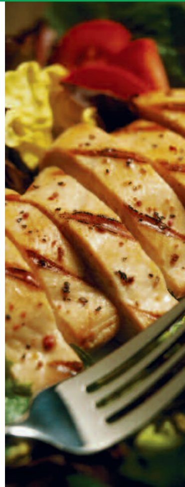
TABLE 7. DAILY PROTEIN RECOMMENDATIONS

Protein has always been a particularly popular nutrient with athletes because of its role in building and maintaining muscles. While protein is necessary, it is not the primary fuel for working muscles. Athletes need to consume a wide variety of high-quality protein foods in their diet. However, consuming more protein than the body can use is not going to give athletes larger and stronger muscles. Research shows that protein requirements may be higher for athletes. However, most athletes are already consuming more protein than the body can process. Use the following formulas as guidelines to ensure proper amounts of protein are included in your dietary intake.